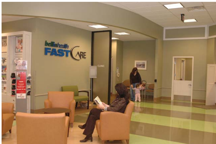
A waiting room at a FastCare Clinic in Suamico, Wisconsin. Bellin Health of Green Bay uses such clinics inside retail stores to help steer patients into primary care practices where, it is hoped, they will become more engaged in preventive health practices.

bers of patients with the health system at a low cost. The broadest point of contact is the MyChart Patient Portal, an online electronic health record that patients can access on their own to get test results, renew prescriptions, or contact their doctor's office. Patients who do not want to use the online tools also have the option of using a telephone help line through which they can reach a nurse twenty-four hours a day, seven days a week.